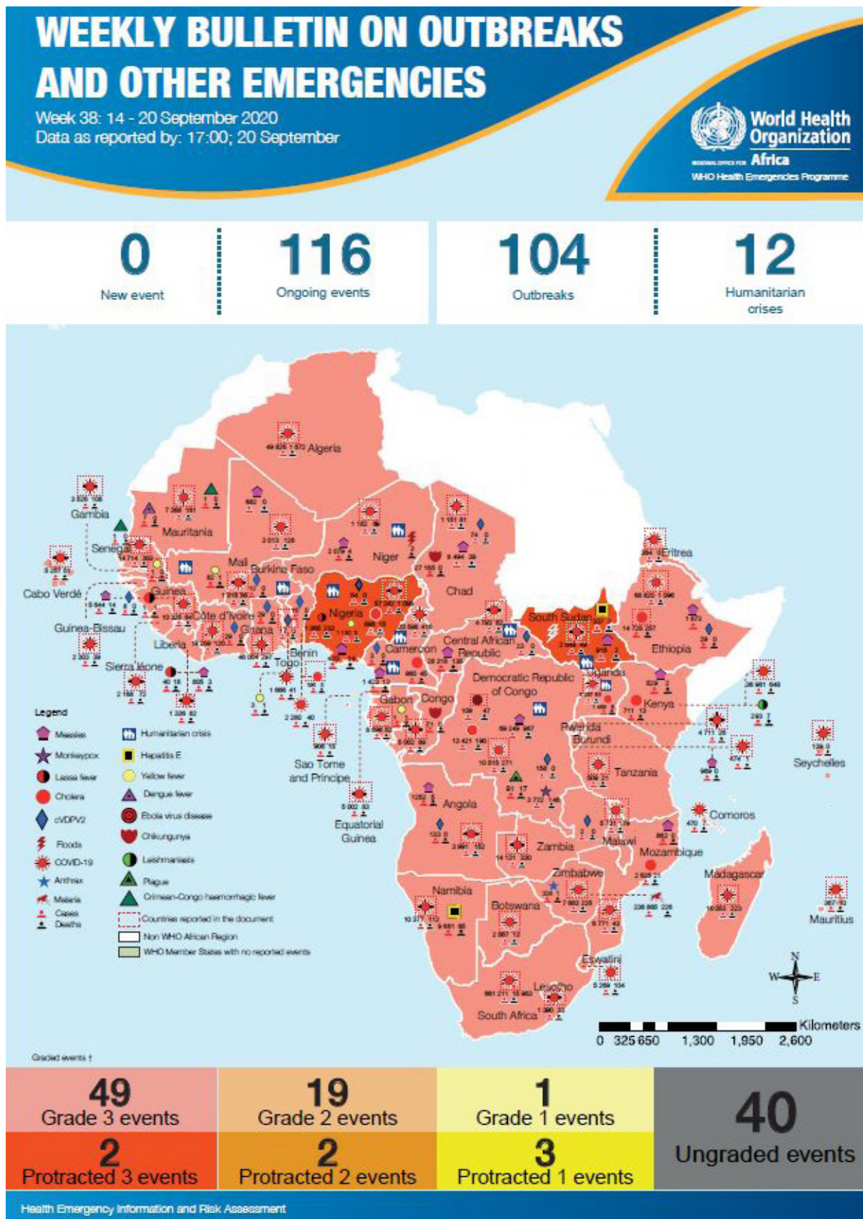
Figure 3. The Weekly WHO Outbreak and Emergencies Bulletin focuses on selected public health emergencies occurring in the WHO African Region. The African Region WHO Health Emergencies Programme is currently monitoring 116 events. For more information see link below:

https://apps.who.int/iris/bitstream/handle/10665/334353/OEW38-1420092020.pdf