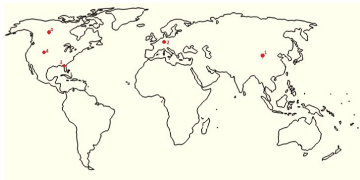
Figure 2. Current outbreaks/events that may have implications for travellers. Numbers correspond to text above. The red dot is the approximate location of the outbreak or event.

The company that had shipped and supplied the implicated onions has initiated recalls of their onions and related onion-products in both Canada and the USA. Investigations conducted by the Canadian Food Inspection Agency and the USA Food and Drug Administration have shown a link between the illness and red onions; however because of the way the onions are grown, harvested and packed, other onion types (e.g. white, yellow or sweet yellow) are also likely to be implicated.