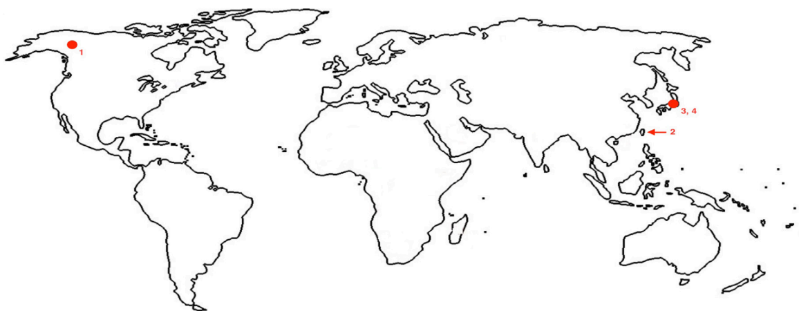
Figure 2. Current outbreaks/events that may have implications for travellers. Numbers correspond to text above. The red dot is the approximate location of the outbreak or event

The care facility has reportedly used the kettle for about 10 years and part of the inside had turned black.